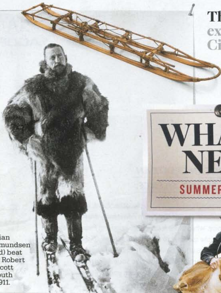
Norwegian Roald Amundsen (pictured) beat Britain's Robert Falcon Scott to the South Pole in 1911.

The Deadly Race A new exhibition at New York City's Natural History Museum retells the 1911-'12 race to the South Pole ( amnh.org ).